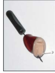
CIC vent tool

Wax buildup is the number one cause of instrument failure. It is very important to keep your hearing instruments as clean as possible. To avoid potential repairs, clean your instrument daily.